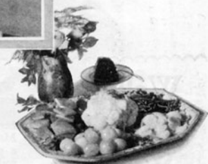
Alluring dishes are made from the choice foods you buy at Piggly Wiggly.

Luxuries for special occasions—favorite goods for every day. Here they all are, spread out for you to look them over. From the huge number of grades and kinds on the market, the finest of each food have been sifted out by the experienced Piggly Wiggly buyers, for your choice.