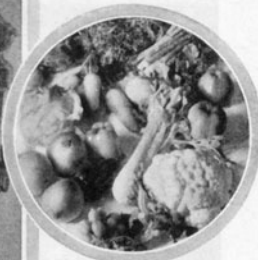
You choose according to your own judgment from the Piggly Wiggly shelves and know that you are saving money.