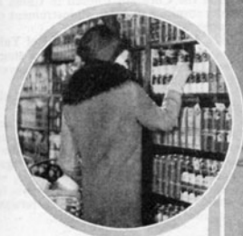
No delay at a Piggly Wiggly store. Baskets in hand you shop at just the speed you wish.