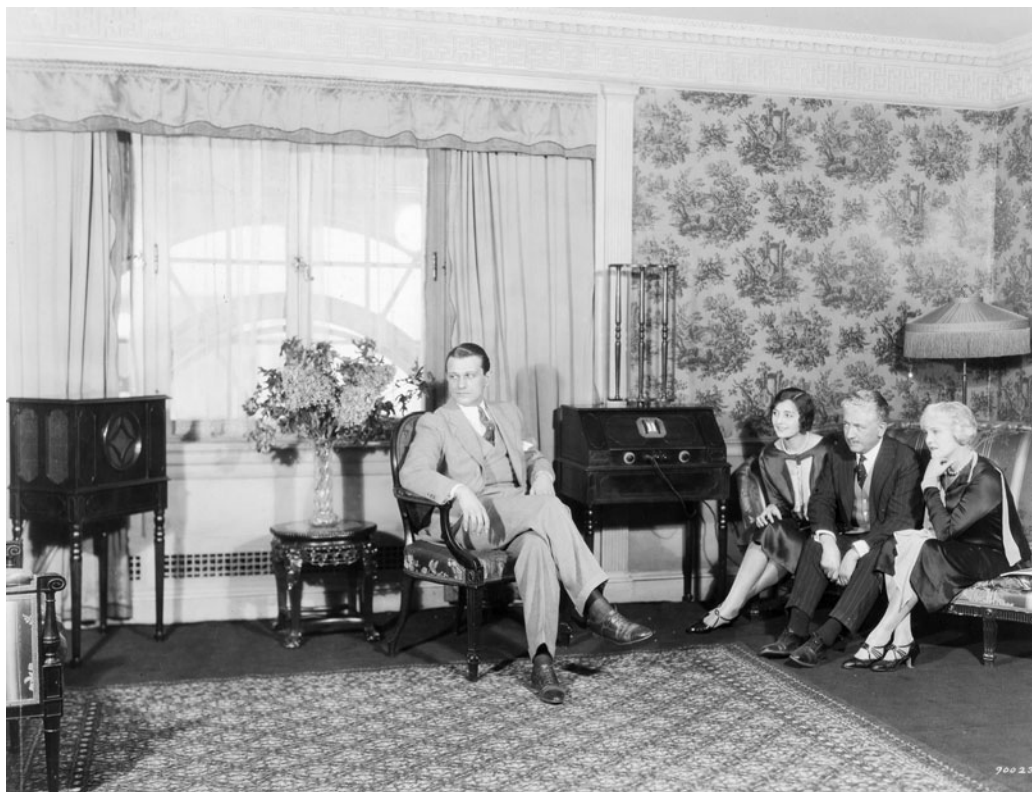
FIGURE 1.6. The Advertiser's Dream: The Expectant Family Ready to Listen.

num and effective exposure, especially at times when the prospects were susceptible to an advertising message. By 1934 one network executive would claim, "When you use radio . . . you are dealing with something that has become an integral part of the life of the average family." 127